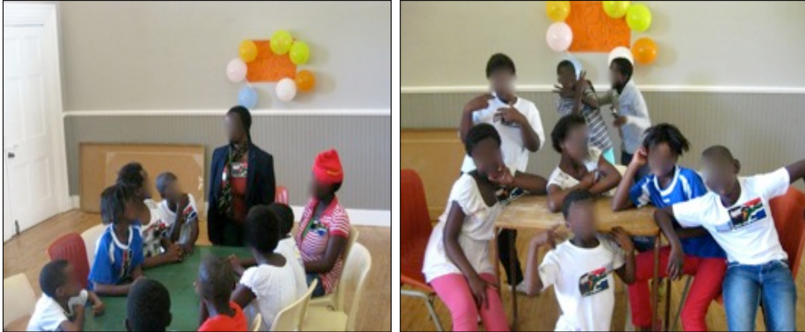
Figures 2 and 3: A cabinet of youth health advisors (2014). Here, the appointed minister consults her cabinet on their experiences of health services. [Faces blurred to protect participant confidentiality.]