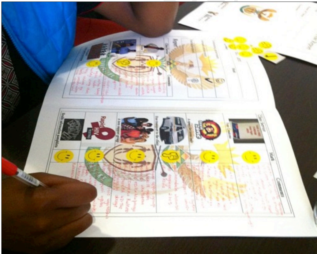
Figure 1: A teen advisor fills out a 'clinic report card' at the Teen Advisory Group, marking the provision of health services in the local clinic with 'smiley face' or a 'thumbs down'.

These activities were supplemented by an audit of health interventions with adolescents, caregivers, healthcare workers, traditional healers and faith-based organisations, in conjunction with key informant interviews in local, provincial and national settings.